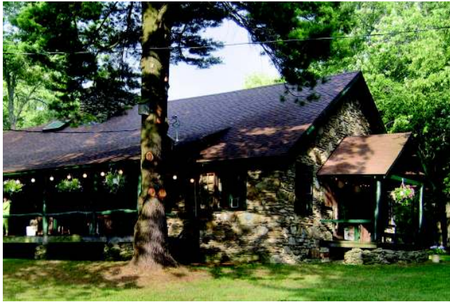
Alumni End was built in 1932 with rock from the property.

Camp Choconut is located on a natural, spring-fed private lake in Pennsylvania's Blue Ridge Mountains 17 miles south of Binghamton, New York. 180 miles from Philadelphia, New York City, and Buffalo, Camp Choconut's climate features smog-free mountain air, warm days and cool nights. The rustic camp buildings are built of materials found in the area. The sleeping cabins are of wood and Alumni End, the 70+-year-old meetinghouse, is of stone.