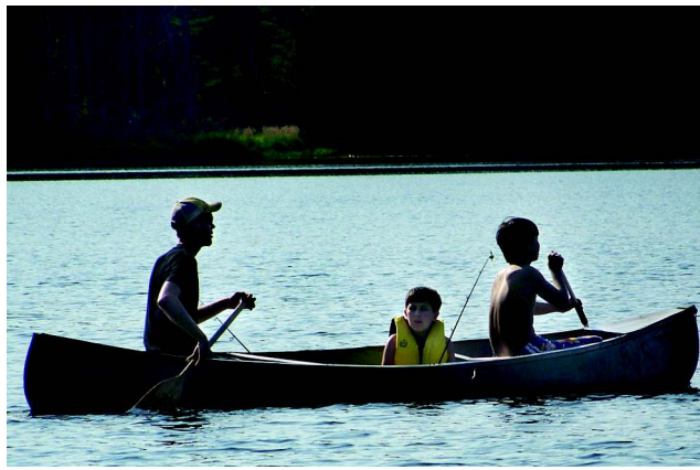
Canoeing is one of many skills taught at Camp Choconut.

Camp Choconut offers a safe place for boys to explore in a pristine, natural setting under the supervision of counselors who are carefully chosen as good role models. Our goal is to create a safe, supportive, and fun community based on cooperation, simplicity, and responsibility.